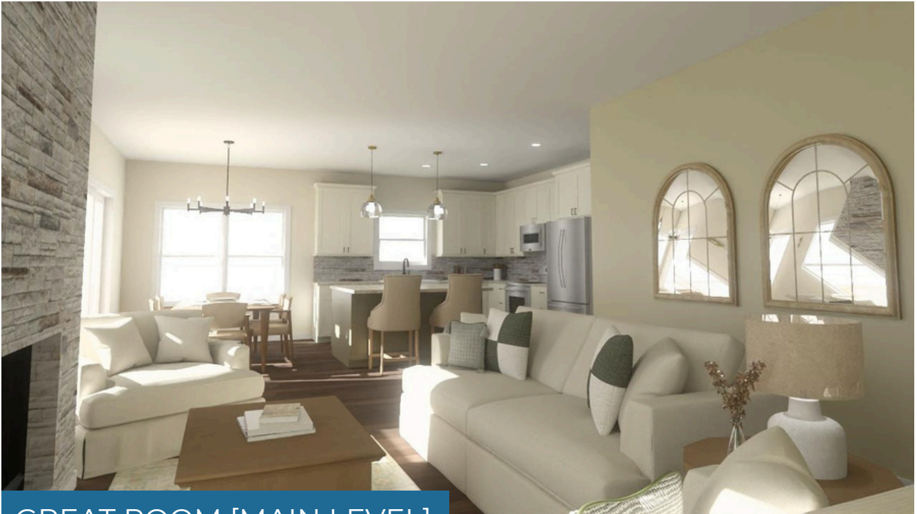
GREAT ROOM [MAIN LEVEL]