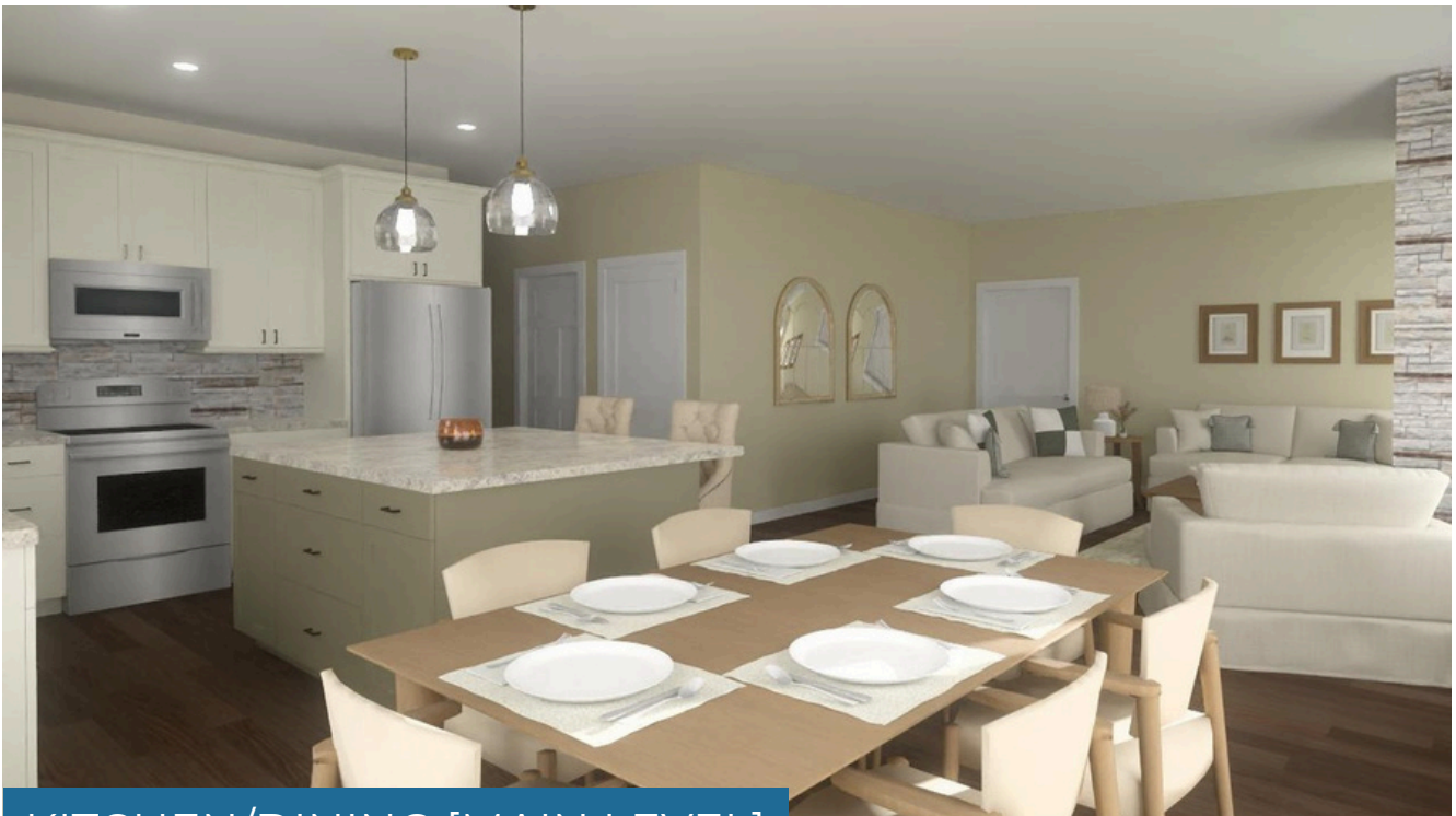
KITCHEN/DINING [MAIN LEVEL]