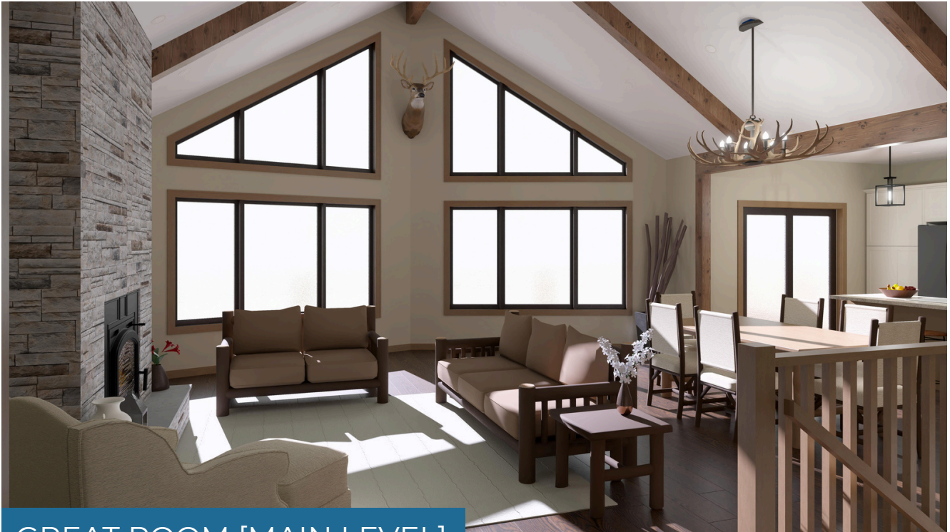
GREAT ROOM [MAIN LEVEL]