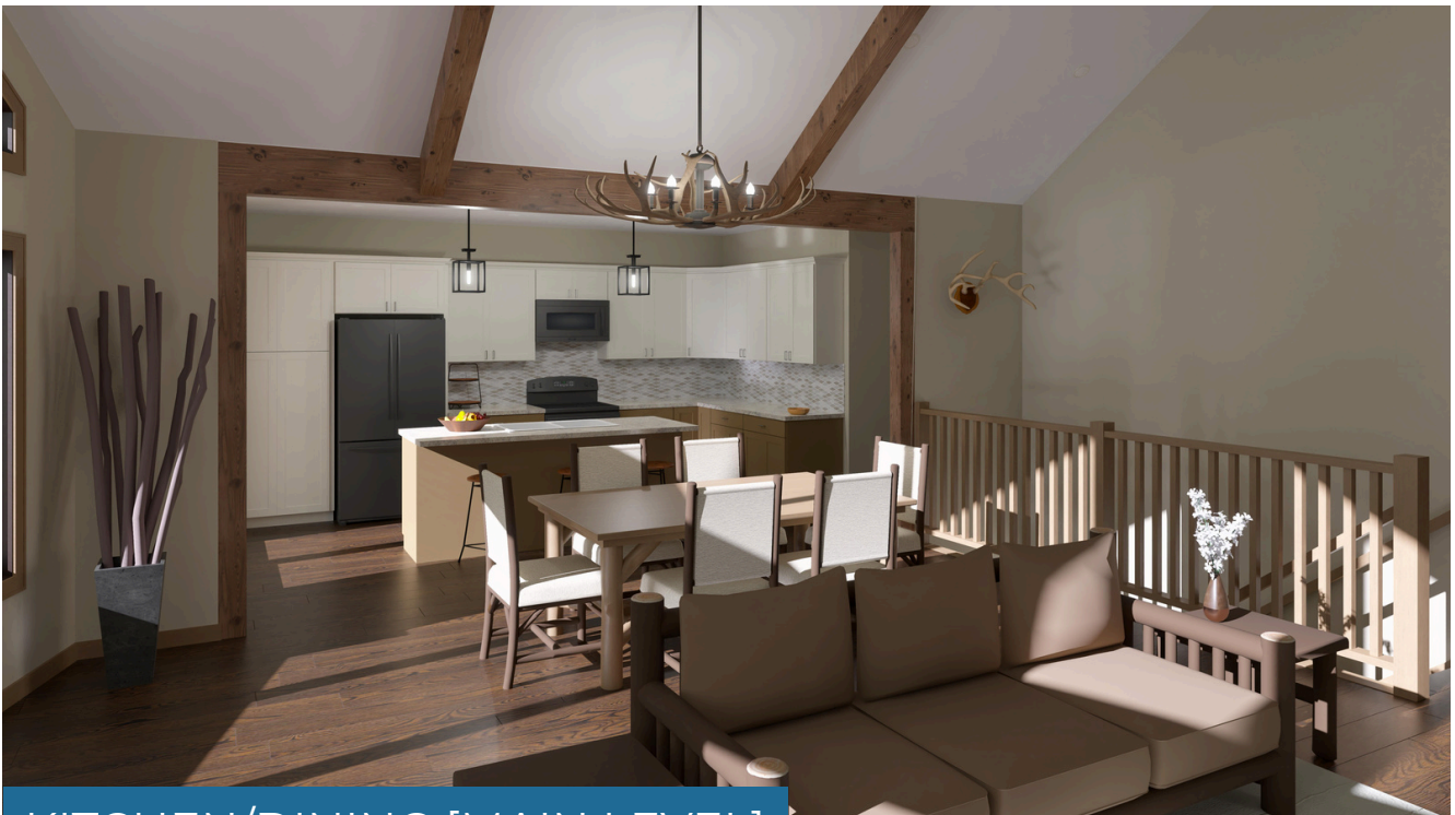
KITCHEN/DINING [MAIN LEVEL]