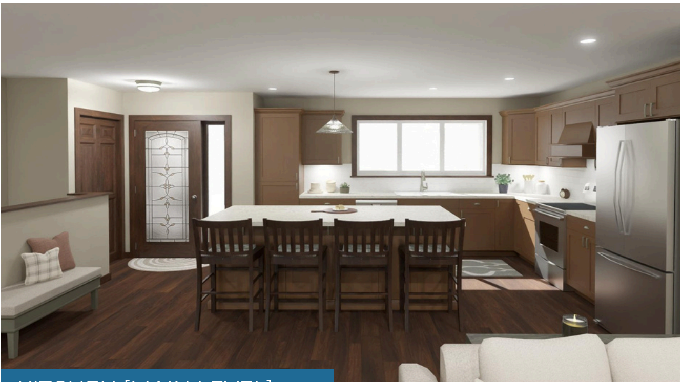
KITCHEN [MAIN LEVEL]