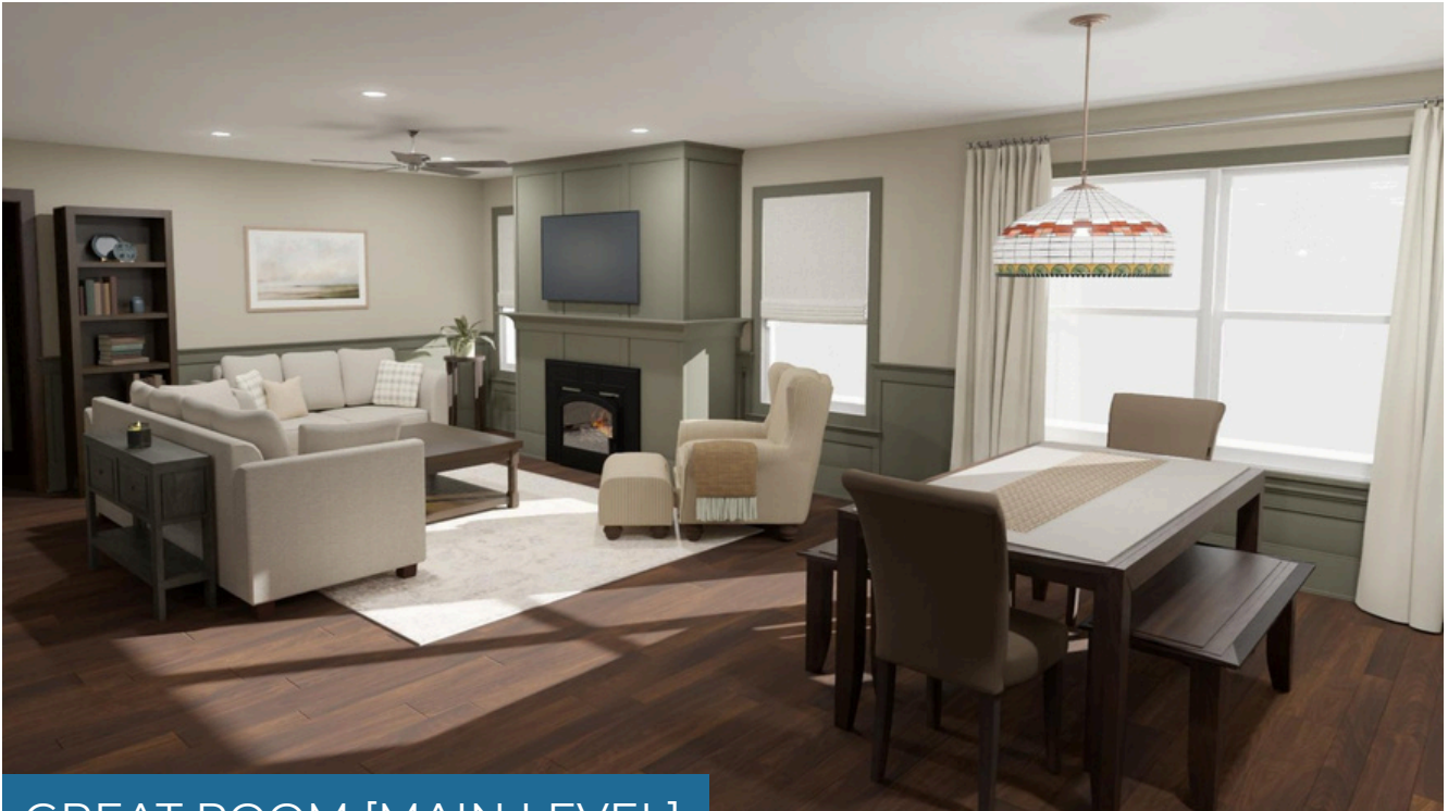
GREAT ROOM [MAIN LEVEL]